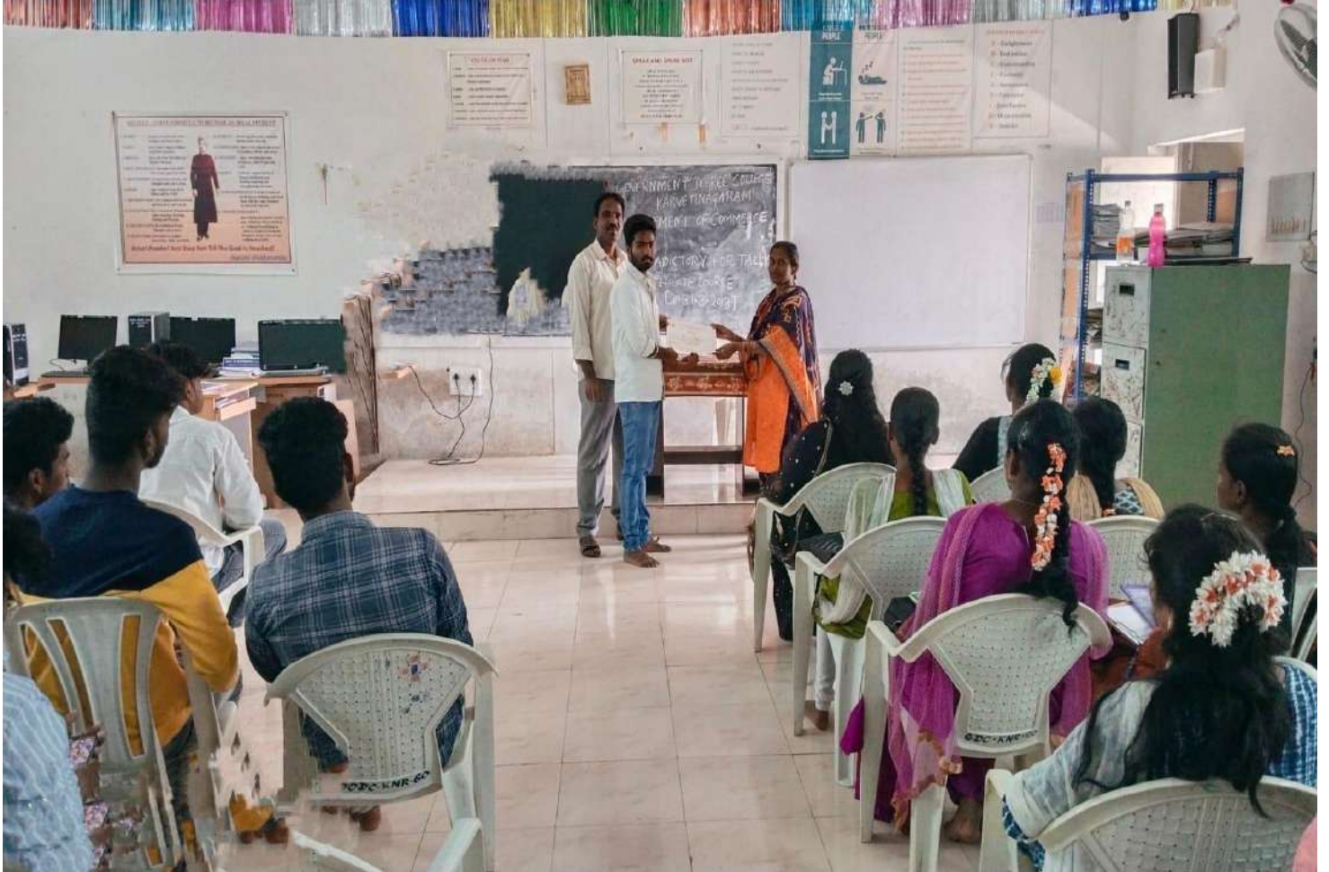
Valedictory of Certificate Course: TALLY